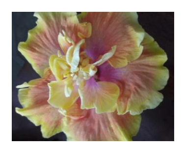
Thanks to everyone who entered! They were all gold ribbon winners! We're going to take a break from virtual mini shows. Hopefully we can meet again soon and have LIVE mini shows!